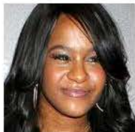
Bobbi Kristina Brown